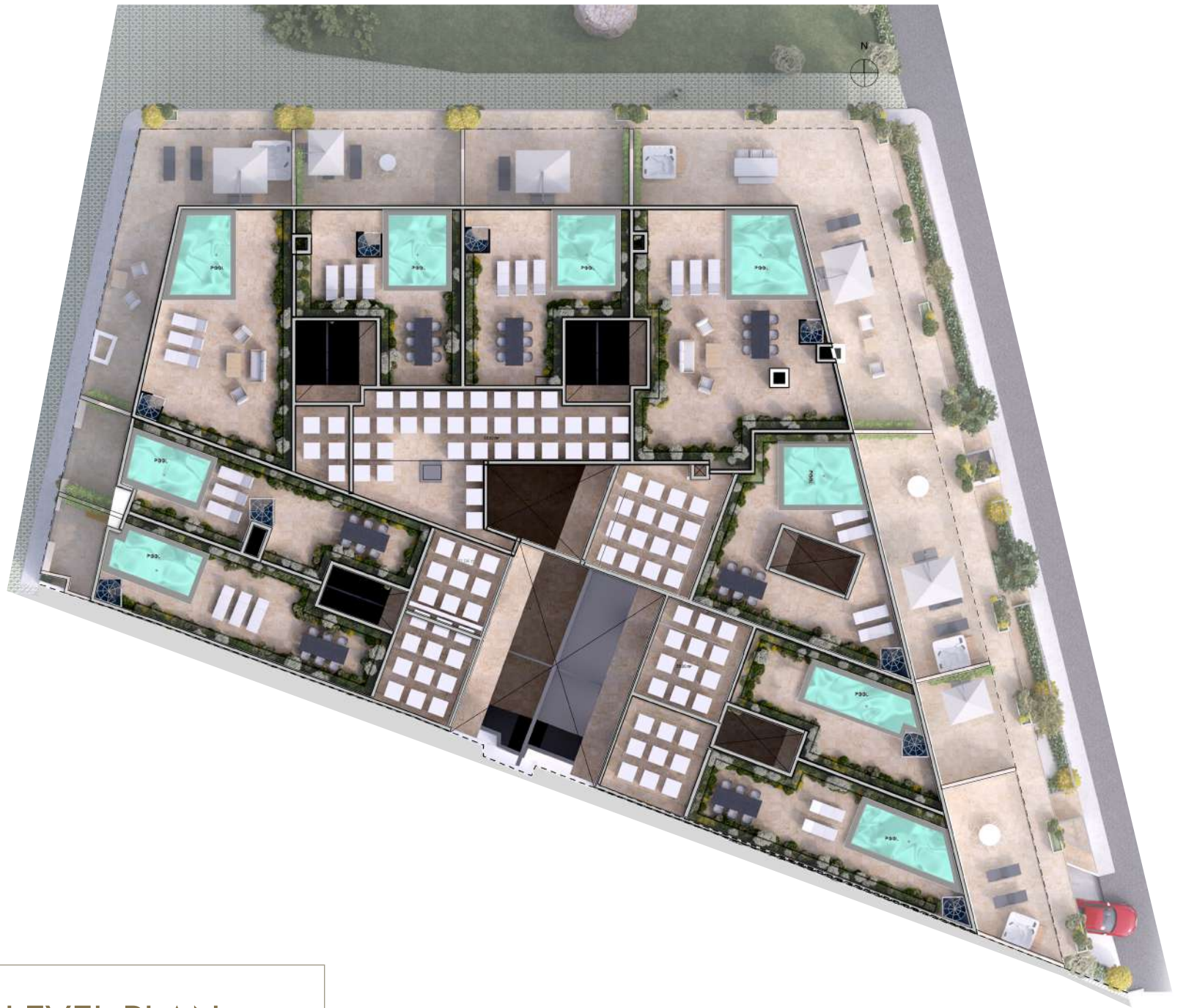
ROOFTOP LEVEL PLAN