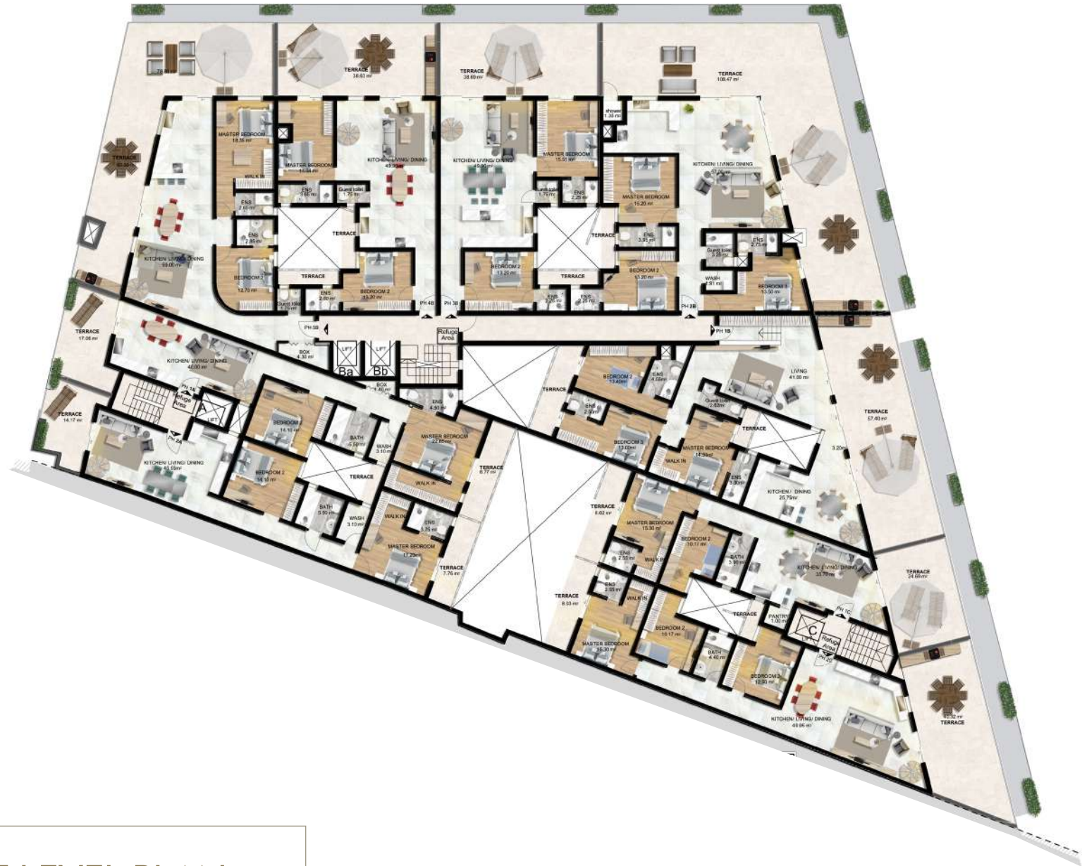
PENTHOUSE LEVEL PLAN