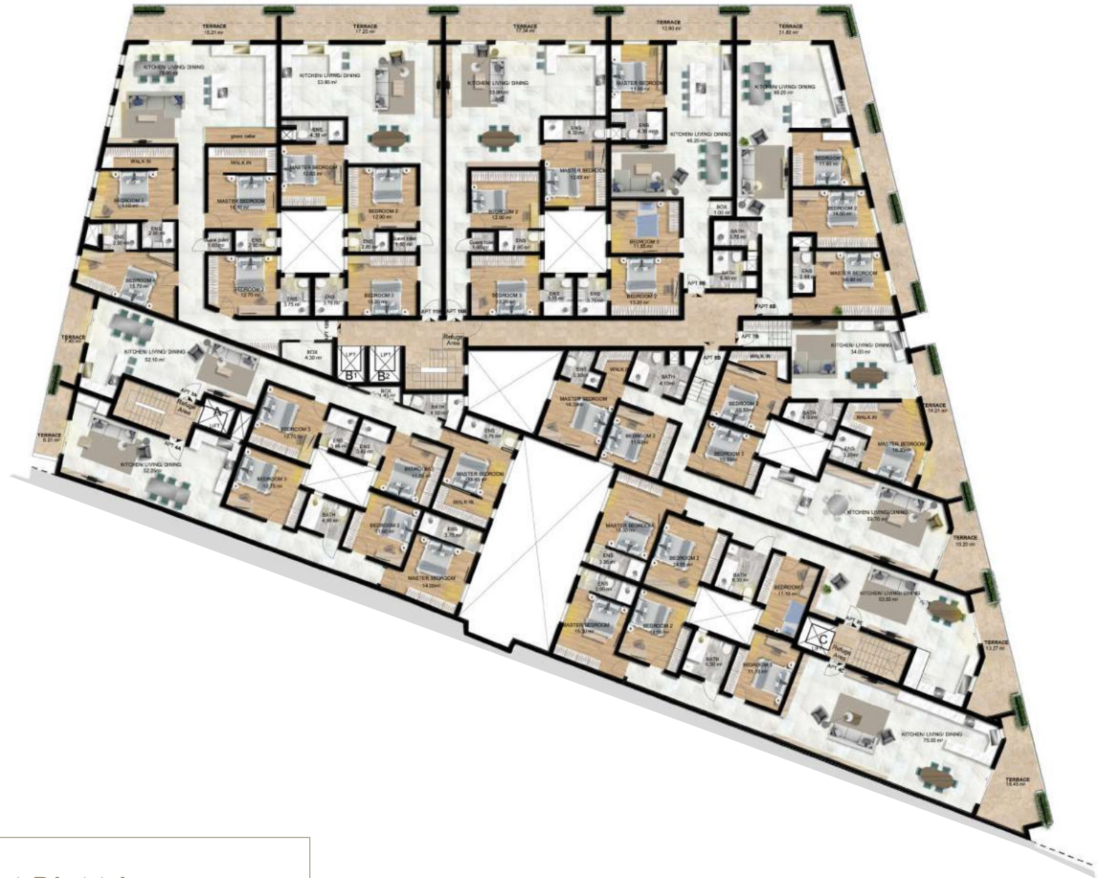
LEVEL I PLAN